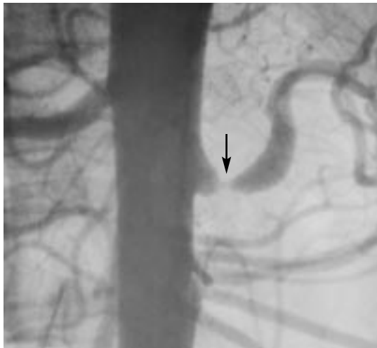
FIGURE 2. Arteriogram with contrast showing atherosclerotic renal artery stenosis of the proximal left renal artery. Atherosclerosis accounts for nearly 90% of cases of renal artery stenosis.

Typically, patients with atherosclerotic renal artery disease are older, with a history of smoking, hyperlipidemia, diabetes mellitus, and obesity, and gradually develop renovascular disease in the setting of preexisting essential hypertension. Therefore, even when renal artery stenosis of 75% or greater is present, renal revascularization may fail to achieve clinical benefits. In some patients, successful revascularization may allow control of resistant hypertension, sometimes with a decrease in the number of antihypertensive medications, and it may allow for safer use of ACE inhibitors in patients who may benefit from the cardiorenal protective effects of these drugs, such as those with congestive heart failure or proteinuric renal disease.