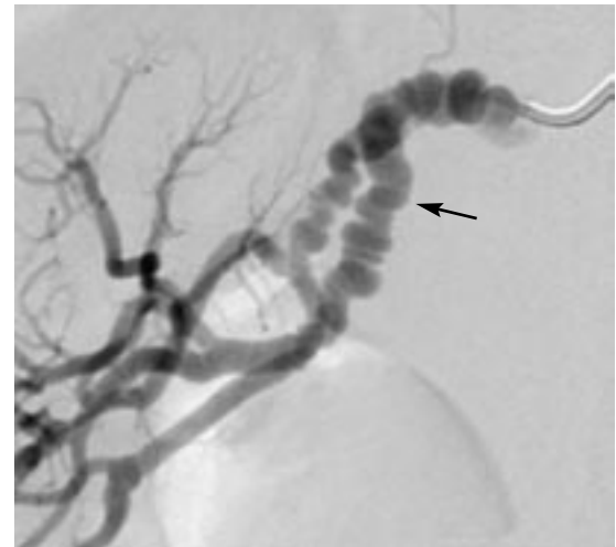
FIGURE 3. Arteriogram with contrast showing fibromuscular dysplasia of the middle right renal artery.

of beads” appearance on angiography and, in contrast to atherosclerotic lesions, predominantly involve the mid-to-distal segment of the artery (FIGURE 3).