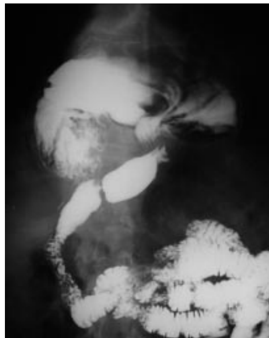
FIGURE 2. Upper gastrointestinal series in the same patient, showing a large type III paraesophageal hernia with organoaxial rotation.

Paraesophageal hernias account for 5%–10% of hiatal hernias