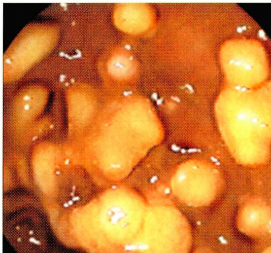
FIGURE 1. Colonoscopic view of pseudomembranous colitis secondary to Clostridium difficile .

The enzyme immunoassay is more common and practical for clinical use. It has a sensitivity of 70% to 95% and a specificity of 99% to 100%. 1 Sending more than one stool sample for enzyme immunoassay testing during the