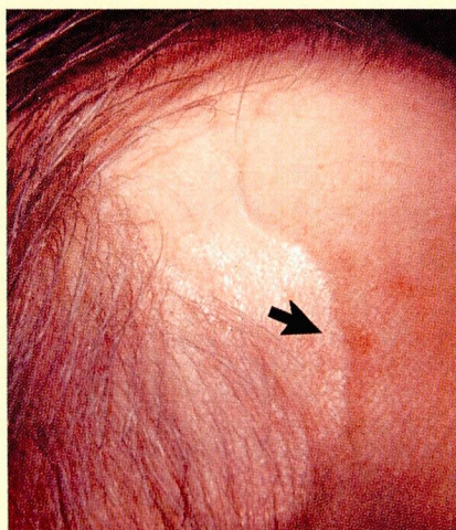
FIGURE 1 Swollen temporal artery (arrow), occasionally seen in giant cell arteritis.