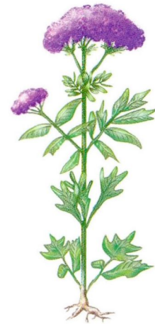
Valerian ( Valeriana officinalis )

should be avoided to minimize the risk of serotonin syndrome. Serotonin syndrome is characterized by confusion, shivering, agitation, fever, diaphoresis, diarrhea, myoclonus, hyperreflexia, and tremor. However, no study of systemic interactions with drugs or food has been conducted.