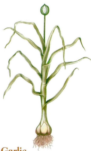
Garlic ( Allium sativum )