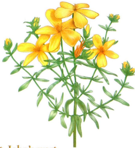
St. John's wort ( Hypericum perforatum )