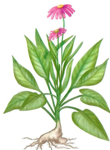
Echinacea ( Echinacea angustifolia , purple coneflower)

Echinacea , also known as purple coneflower and snakeroot, has been promoted for preventing cold and flu symptoms. Although its mechanism of immune stimulation is unknown, it may work by stimulating the production of phagocytes. 25