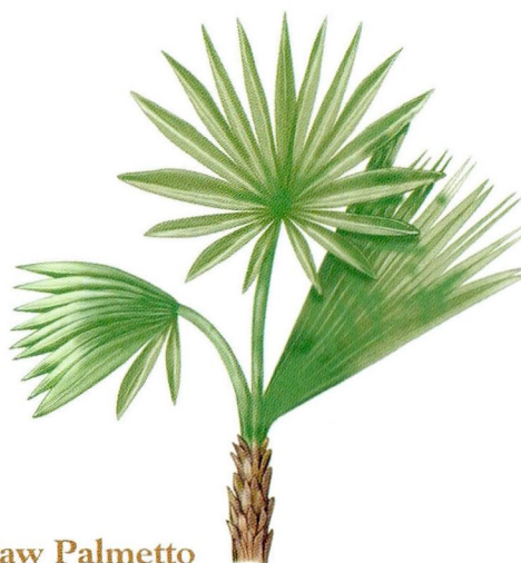
Saw Palmetto ( Serenoa repens )

Saw Palmetto is widely used in Europe to treat benign prostatic hyperplasia (BPH). In fact, up to 90% of patients with BPH in Europe take herbal medications, and 50% of European urologists prefer herbs to alpha blockers.