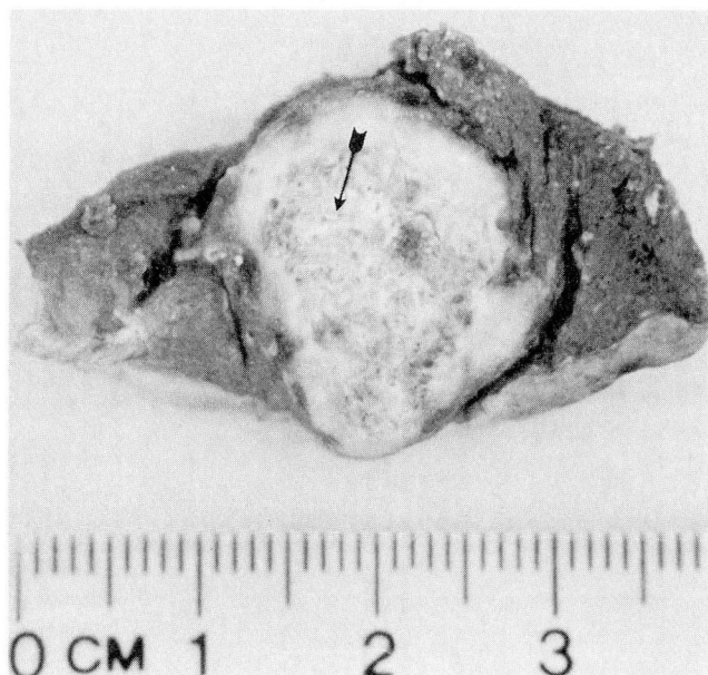
FIGURE 2. Cut surface of the surgical specimen; arrow points to the white filaments.

The specimen consisted of a wedge-shaped portion of lung parenchyma measuring 6 \times 2.5 \times 2.5 cm. The pleural surface was smooth. The cut surface demonstrated a pale tan, firm, sharply circumscribed nodule measuring 1.7 cm at the greatest diameter, with several centrally located small firm white filaments less than 1