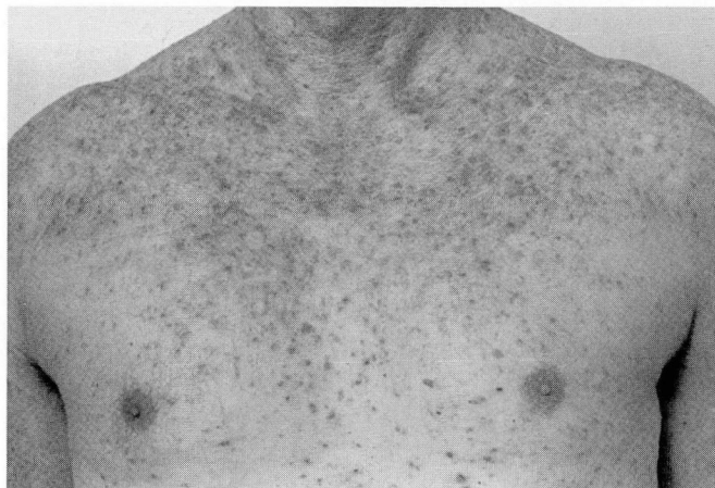
FIGURE 1. Discrete and confluent red papules on the chest consistent with a diagnosis of TAD.

Two additional biopsies showed focal acantholytic dyskeratosis consistent with Darier's type of TAD. The stratum corneum was hyperkeratotic with regions of orthokeratosis and parakeratosis and there was sharply circumscribed focal acantholysis of the epidermis with suprabasal cleft formation (Figure 2 and 3). Dyskeratotic cells were present in the upper epidermis and there was a perivascular lymphohistiocytic infiltrate in the papillary dermis. Direct immunofluorescent microscopy of papules and vesicles revealed no deposition of IgG, IgM, IgA, C3, and fibrinogen.