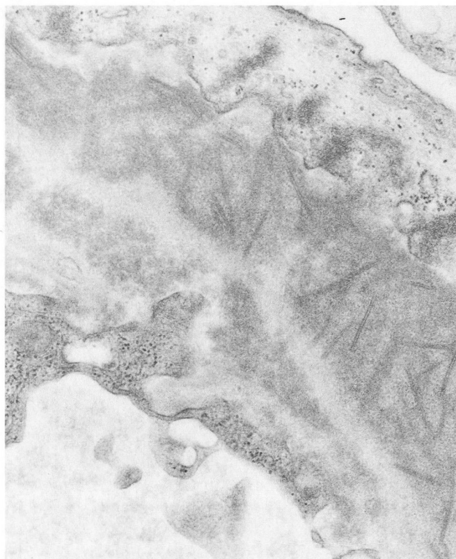
FIGURE 2. Electron photomicrograph demonstrating epimembranous and intramembranous dense deposits. The dense deposits appear to be in part tubular. There is no evidence of amyloid fibrils. Lead citrate and uranyl acetate \times 21,000 .

The renal biopsy revealed membranoproliferative glomerulonephritis (Figures 1 and 2). Biopsy of the ur-