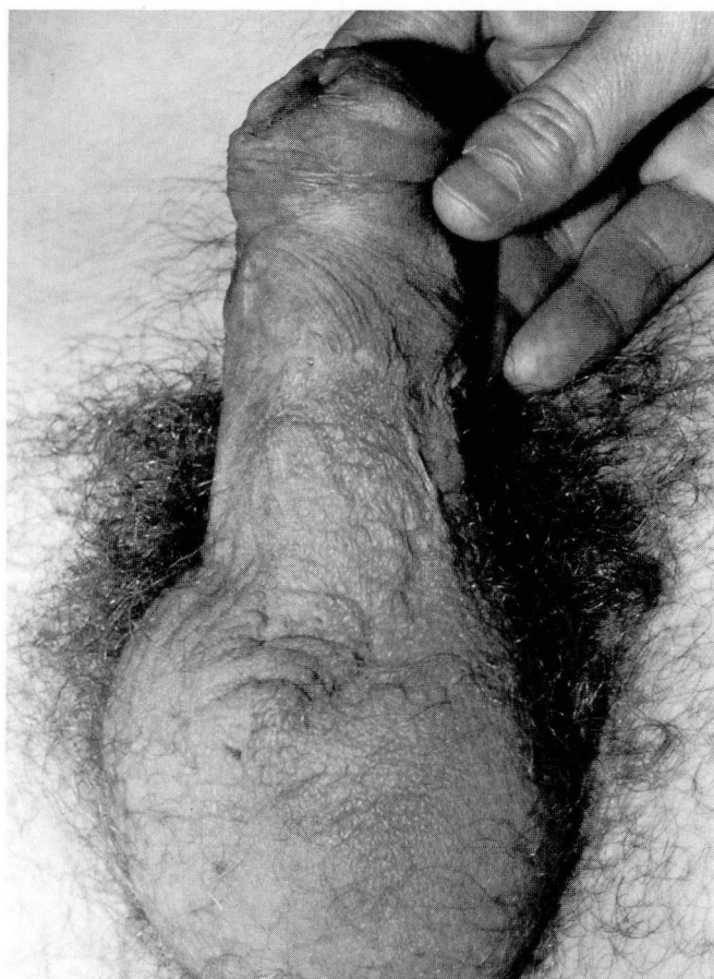
FIGURE 4. Case 2. Successful Mathieu hypospadias repair with excellent coverage of ventral penis.

Several technical problems in adult hypospadias reconstruction seem to be magnified when compared to the same anatomical abnormality in children. These problems include skin limitations and postoperative erections. We have observed that the amount of redundant foreskin available for repair compared to the size of the penis is less in adults than in children. Also adult skin is thicker and has stronger intracellular attachments and stiffer collagen bonds. 6-8 These factors, when combined, make coverage of skin defects more difficult in adults than in children, particularly if a chordee is present. To compensate for the potential skin defects, the use of scrotal and other skin flaps may be necessary to obtain adequate skin coverage after hypospadias repair, as seen in Case 2 (Figure 4).