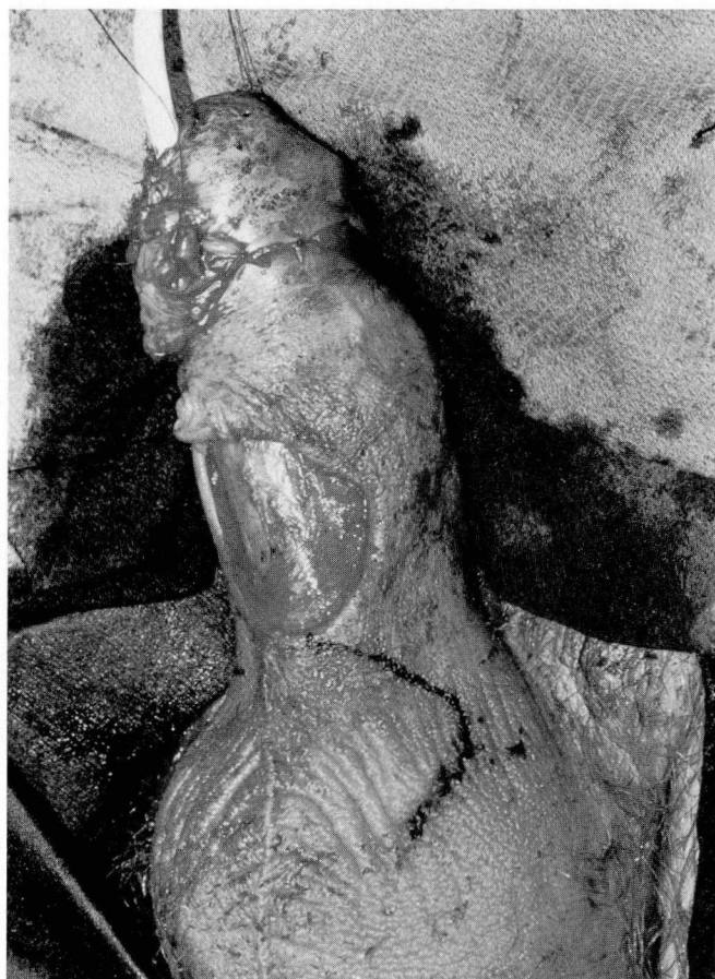
FIGURE 3. Case 2. Ventral skin defect after Mathieu repair.