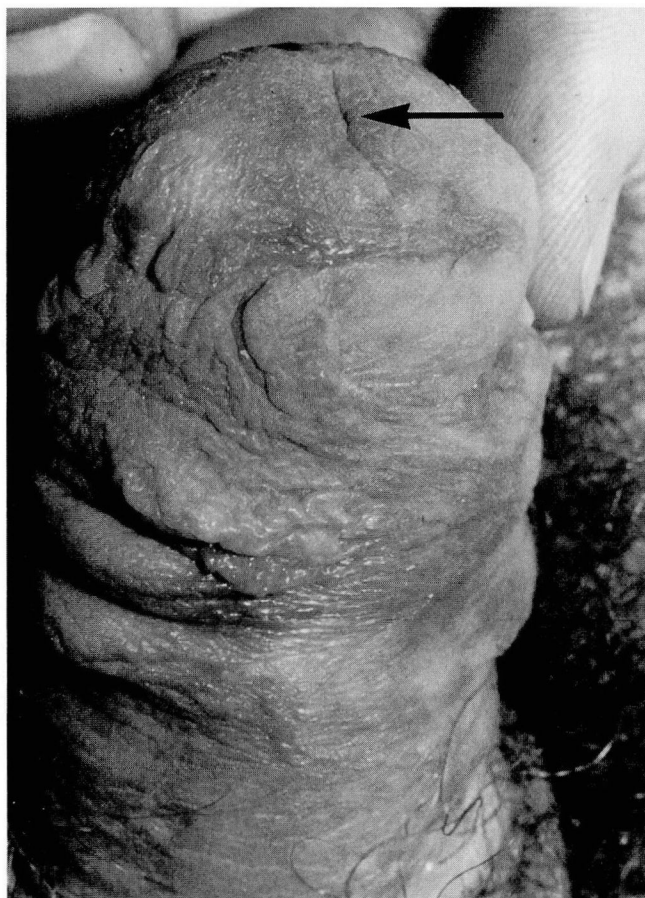
FIGURE 1. Case 1. Successful Mathieu hypospadias repair with meatus (arrow) at tip of glans penis.