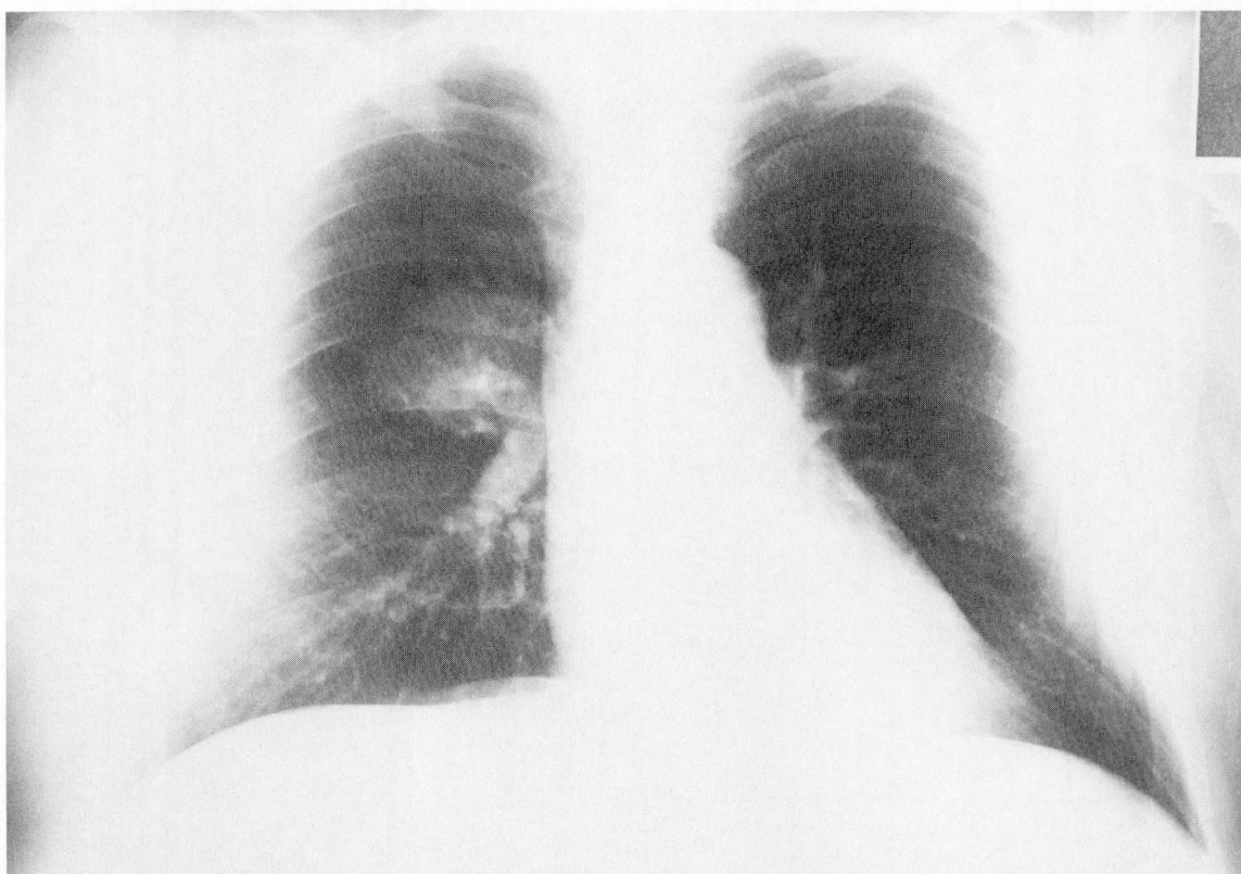
Fig. 1. Chest radiograph showing a mass in the right hilar region.