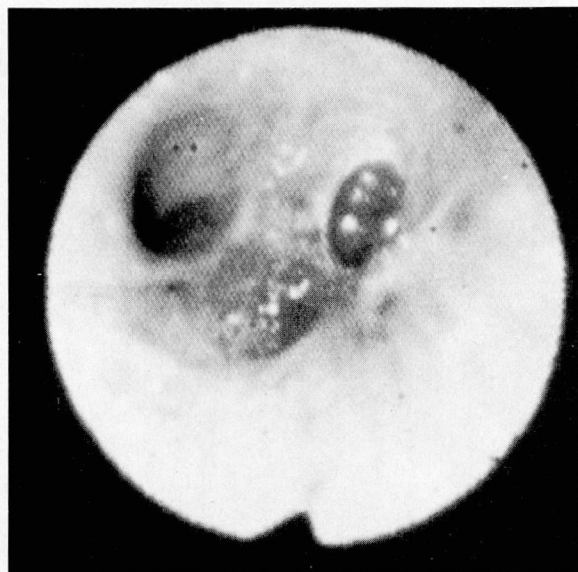
Fig. 2. Bronchoscopic image showing lesion in the right upper lobe bronchus.

abdomen and pelvis was normal with the exception of a solitary gallstone. A bone scan showed increased uptake consistent with a degenerative joint disease. No other abnormalities were identified.