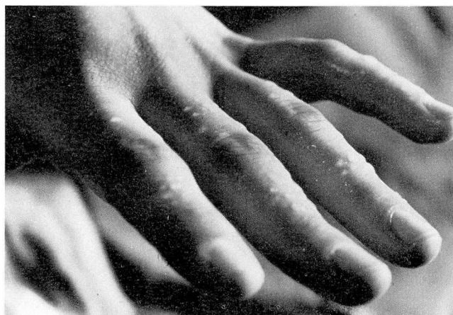
Fig. 1. Visible perspiration on the dorsum of the fingers.

two sheets of paper, one sheet acting as an absorbent shield over the written copy. Many avoid shaking hands or apologize after having done so. One embarrassed patient would adjust her store purchases to an even dollar so as to prevent having to receive change in her hand. Most find it necessary to wear absorbent undergarments, layered clothing, and dark coordinates as camouflage. Some have even undergone serious personality changes and still others have withdrawn from society altogether. 2,3