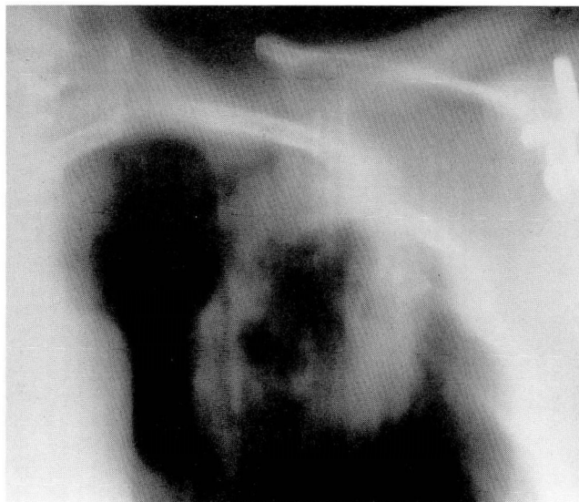
Fig. 2. Tomogram demonstrates the left-upper-lobe cavitating infiltrate in a 50-year-old woman who was taking steroids.

aspergillosis. Ramsay et al, 41 who reviewed 272 renal transplant patients with fever and pulmonary infiltrates, suggested that a relatively well-preserved arterial \text{PaO}_2 on room air, despite extreme involvement demonstrated radiographically, might indicate the presence of fungal or Nocardial disease. Blood cultures, even in disseminated disease, are almost always negative. 1,6,35,36,47 In 7 patients with cardiac aspergillosis reported by Young et al, 1 none had positive blood cultures, either antemortem or postmortem. The chest radiograph is abnormal in 75% to 100% of patients with invasive pulmonary aspergillosis. In its earliest phase, aspergillary bronchitis produces no radiographic signs. Single or multiple nodules (approximately 1–3 cm in diameter) appear as the disease progresses. These nodules correspond to histopathologic target lesions. The chest radiograph may show the following: 37