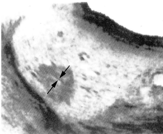
Fig. 3. Longitudinal ultrasound of the right lobe of the liver in a different patient. A well-circumscribed echogenic mass with a septum in its central portion is seen ( arrows ). Combination of these findings is diagnostic of a cavernous hemangioma. No further examinations were required in this asymptomatic patient.

On occasion, cavernous hemangiomas may be confused with malignant lesions. 3 In these cases, a CT scan is employed for further evaluation. If the CT study is made in the conventional manner, the results will be incomplete or may miss the lesion entirely. A dynamic technique is necessary to evaluate the flow of medium as it traverses the lesion and the surrounding tissue. In 70% of cases, cavernous hemangiomas will fill in from the periphery, often with densely enhancing