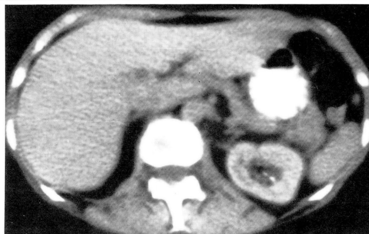
Fig. 2. Serial CT scans of the same section of the liver.

A. A low attenuation mass is identified posteriorly before injection of contrast medium ( arrow ).