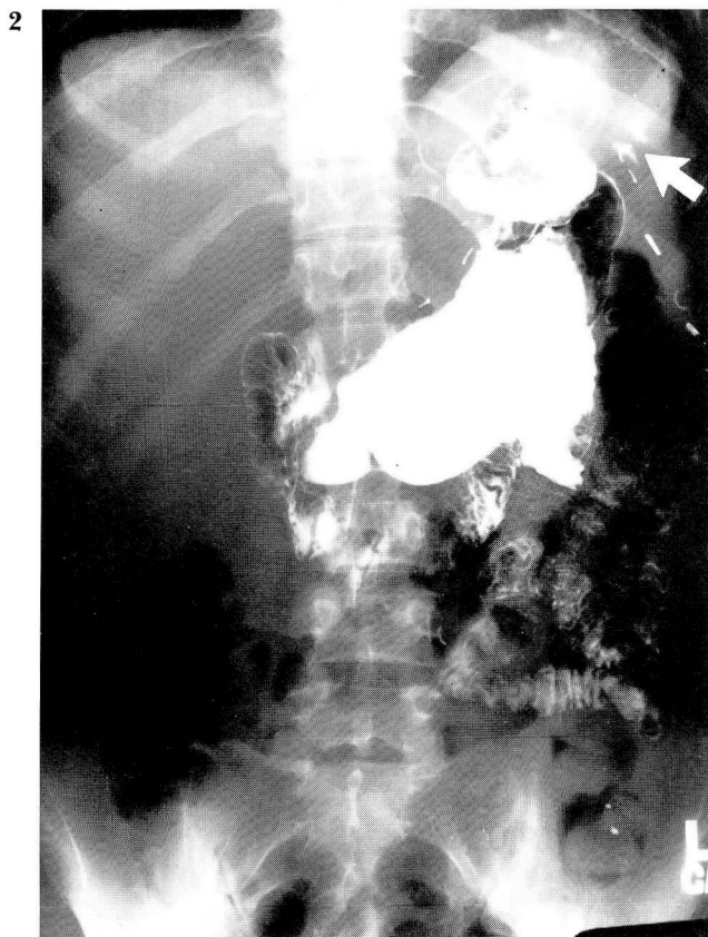
Fig. 1. Angelchik prosthesis.