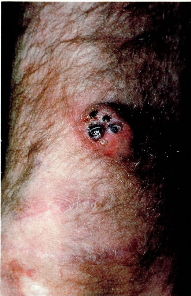
Figure 1. Violaceous, crusted nodule on the upper anterior aspect of the left leg.

imens such as exudate, tissue, or granules (often characteristic of mycetoma). Culturing onto media with antibiotics is necessary to ensure elimination of bacterial contaminants. Cultures become positive within seven days, and both the color of the mycelium and the microscopic appearance of the stained hyphae are usually sufficient for a presumptive identification of P. boydii . The diagnosis can be confirmed by the exoantigen test, which involves fungus-specific antisera; however, presumptive identification and a consistent clinical picture are usually adequate.