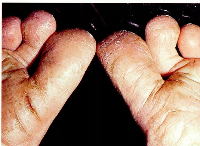
Figure 1. JPD showing crazing of horny layer.