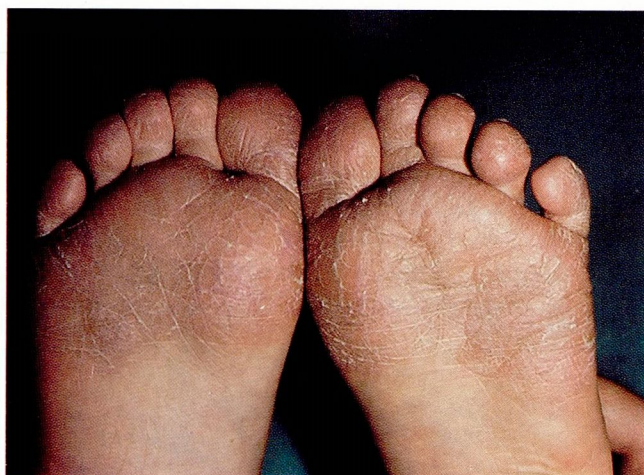
Figure 3. JPD in patient before treatment.

Prior to 1968, the literature contained few references to noninfectious, nonallergic derma-