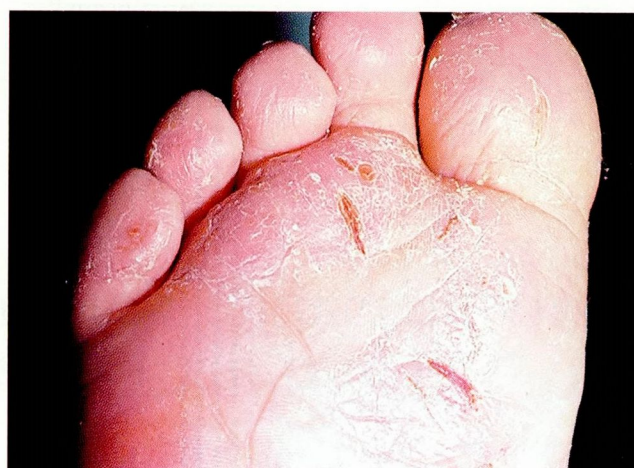
Figure 2. JPD showing fissures penetrating the dermis.

plantar pads of the forefeet; the medial edges, plantar pads, and tips of the great toes; the lateral edges and plantar pads of the little toes; the tips of the other toes; and occasionally the edges of the heel pads. The thin skin of the interdigital areas and arches is not involved.