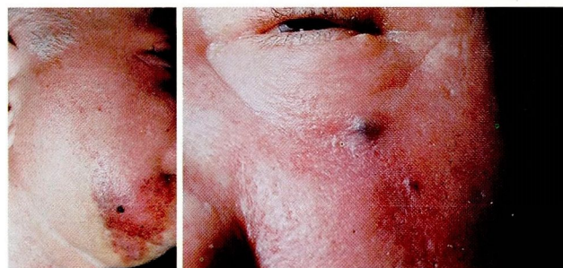
Figure 1. Poorly demarcated, purple plaque with dark papule on right jawline.

The history of progressive facial swelling in an elderly man with the presence of poorly demarcated, indurated, vascular plaques on the head established the diagnosis of angiosarcoma in our patient; micro-