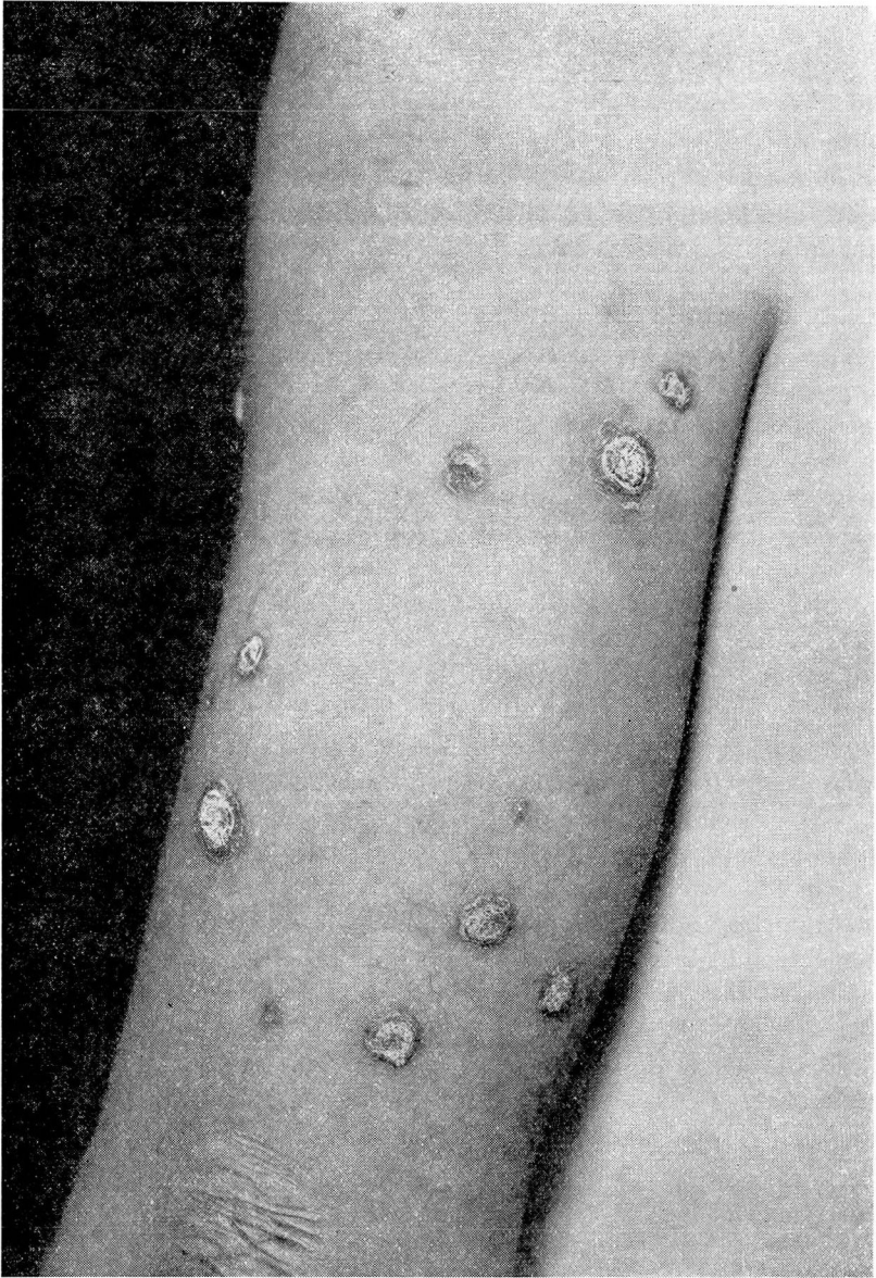
FIGURE 1, CASE 1: Psoriasiform syphilids. Note the collarette of loose epithelium at periphery of the lesions.

early syphilis. The arsenical which had been administered (probably neoarsphenamine) was ineffective; therefore, mapharsen was selected as the arsenical to be used and the heavy metal therapy was to consist of intramuscular injections of bismuth salicylate.