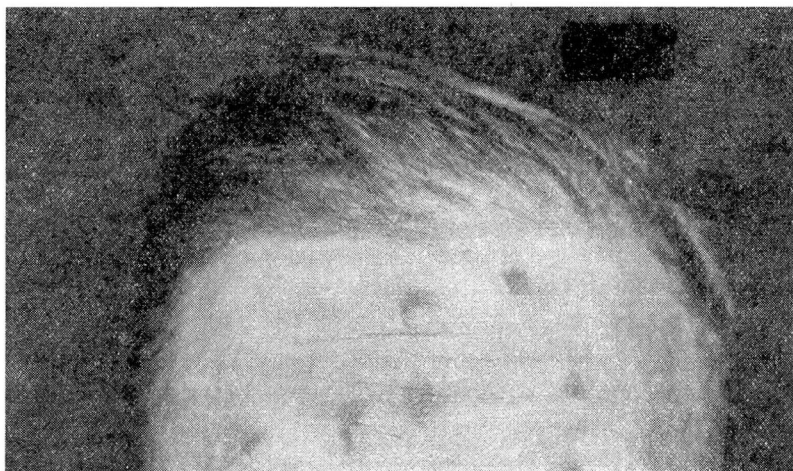
FIGURE 2, CASE 1: Dull red, smooth cutaneous nodules on forehead. There were similar lesions on the upper lip and chin.

referring physician reported that the eruption had disappeared after a few injections of mapharsen and that there had been no mucocutaneous relapses. A recent report on the blood serology was not available, but the patient was still under treatment and was cooperating satisfactorily.