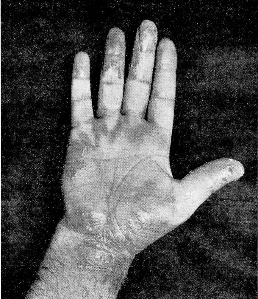
FIGURE 4, CASE 2: Infiltrated squamous plaque on wrist and palm. Note collarette of loose epithelium at margins of the lesions.

A biopsy of one of the papules on the back showed a chronic inflam-