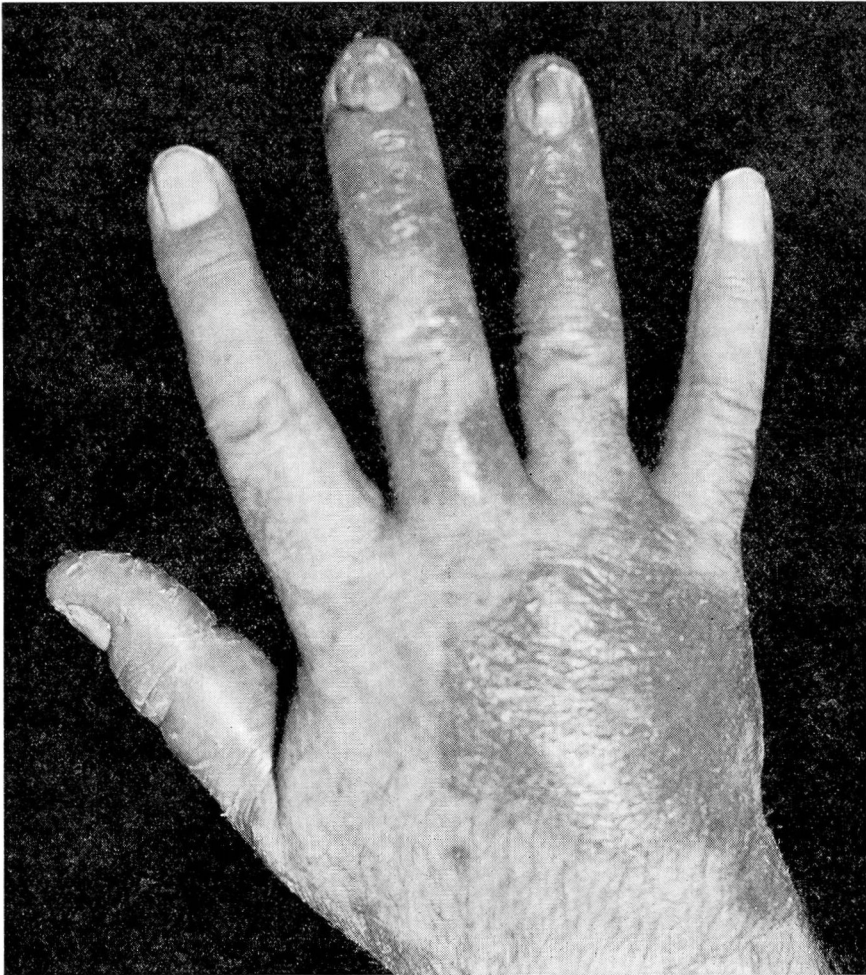
FIGURE 3, CASE 2: Large, squamous plaque on dorsal surface of the hand. Syphilitic onychia of nails of ring and middle fingers.

There were large, flat, scaly papules on the back and upper extremities.