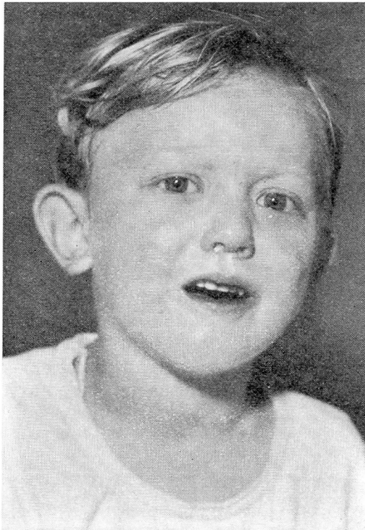
FIGURE 1: This boy, two and one-half years of age, had diffuse goiter with severe hyperthyroidism. Subtotal thyroidectomy was performed and he was well two years after operation.

Hyperthyroidism is rarely encountered in patients in the extremes of life. In a series of 13,200 consecutive cases of hyperthyroidism seen at the Cleveland Clinic since 1925, there have been only 42 cases in children under 14 years of age and only 45 cases in patients beyond the age of 70. The youngest child undergoing thyroidectomy for hyperthyroidism was a boy of 2½ years and the oldest patient was a man 81 years of age. (Figs. 1 and 2.)