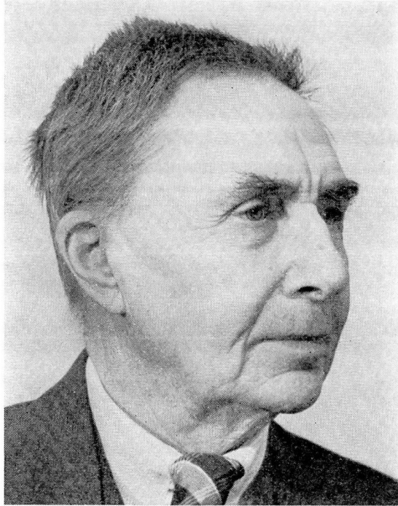
FIGURE 2: Photograph of man, 83 years of age, who had nodular goiter with hyperthyroidism. Thyroidectomy was performed and he is well two years after operation.

In this series, hyperthyroidism in children was always associated with a diffuse enlargement of the thyroid whereas adenomatous glands were present in 96 per cent of the patients over 70 years of age. In the aged, the clinical picture of hyperthyroidism is distorted by the myocardial, vascular, and cerebral changes of senility. Striking differences in the clinical expression of hyperthyroidism in children and in the aged are therefore found.