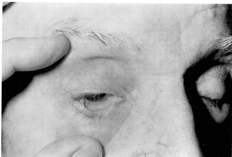
Fig. 1. Cicatricial pemphigoid changes in the left eye.

The Department of Dermatology was then consulted and histopathologic studies were done. A biopsy specimen of buccal mucosa submitted at that time for routine hematoxylin-eosin staining as paraffin sections was devoid of stratified squamous epithelium and showed only angioplasia and chronic inflammation in the remaining submucosal connective tissue when examined by light microscopy. A diagnosis of cicatricial pemphigoid was made on the basis of the history and classical physical findings.