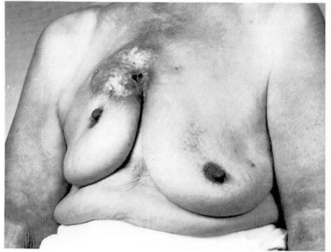
Fig. 2. Ulcerating recurrence of the cancer 20 years after the initial radiation.

the field. This was treated by 2400 rads in 8 days. It did not disappear, but stopped growing, and its growth remained arrested for 7 years. In the meantime the patient was found to have hypertension with blood pressure of 230/118 mm Hg, pulmonary edema, and pleural effusion. Stilbestrol was given, 10 mg daily, because it was suspected that the pulmonary lesions were the result of metastasis. The hypertension also was treated, and the blood pressure fell to 162/