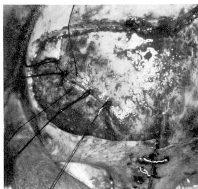
Fig. 4. Intraoperative photograph showing dural plication.

To date, this approach has been used in over 40 cases of craniosynostosis. There has been no reclosure of suture lines. There have been three cases of increasing size of the craniectomy defect; these children required cranioplasties.