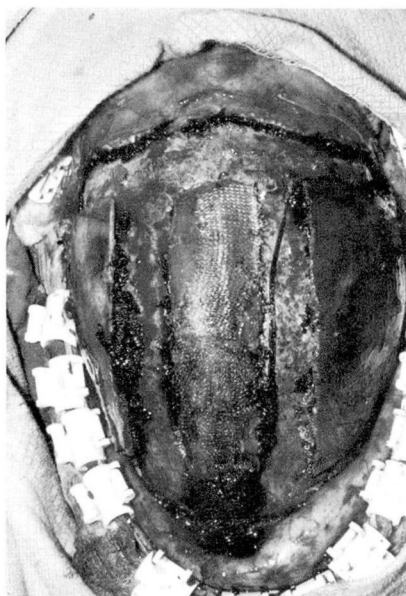
Fig. 3. Craniectomy defects shown at operation. The horizontal limb is across the coronal suture line at the top of the photograph.

The alteration of the dura changes the tensile forces within it. Information is no longer transmitted to the sutural area and reclosure of the suture does not occur.