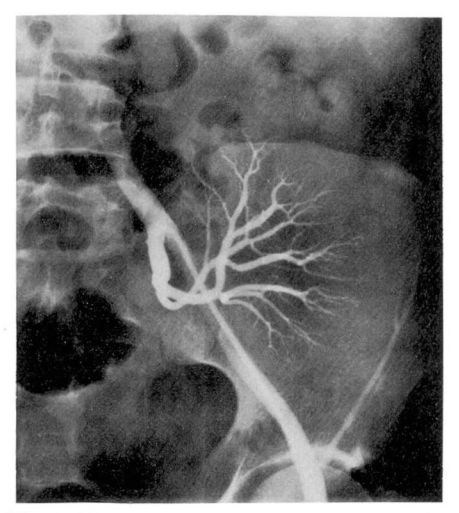
Fig. 4. Normal postoperative renal angiogram demonstrating the conjoined arterial anastomosis.

The clinical experience gained in 24 renal transplant recipients demonstrates that the conjoined vascular anastomosis is an extremely reliable technique for the revascularization of donor kidneys having multiple arteries. This anastomotic technique resulted in a high degree of vessel patency (100%). A normal postoperative renal angiogram is shown in