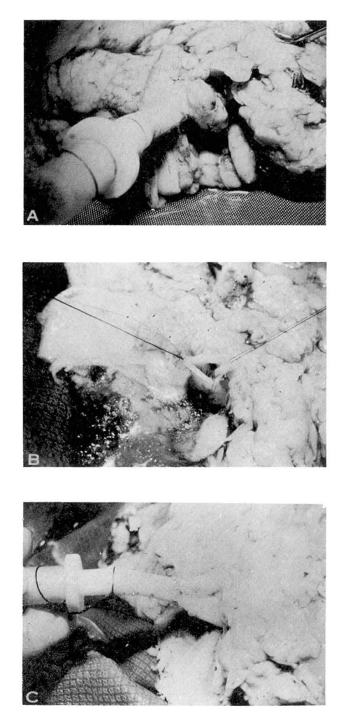
Fig. 2. A, Renal artery aneurysm in donor kidney on pulsatile perfusion. B, Aneurysm has been excised and anterior and posterior divisions of the renal artery have been conjoined to form a common ostium. C, Repair is completed by suturing the normal main renal artery stump to new common ostium; the kidney is placed back on pulsatile perfusion.

ostium. The common ostium was sutured to the normal free stump of the donor renal artery ( Fig. 2). Anastomotic leaks were repaired after the kidney was placed back on pulsatile perfusion. Approximately 12 hours