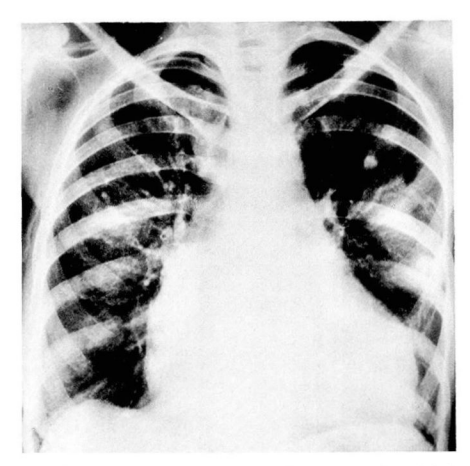
Fig. 1. Chest x-ray film taken on the 14th postoperative day demonstrating an increase in the size of the cardiac silhouette.