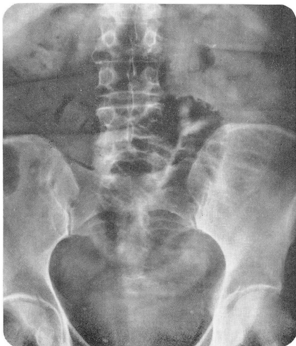
Fig. 3. Case 3. Plain abdominal roentgenogram shows the prominent loop of small bowel, which at operation was found to be incarcerated within a spigelian hernial sac.

The results of the physical examination were normal except for the presence in the left lower abdominal quadrant of a fluctuant, tender mass that was 10 cm long. The patient's temperature was 98.6 F, the pulse rate 88, and the blood pressure 110/80 mm Hg. The blood hemoglobin content was 14 g per 100 ml, the hematocrit 40, and the leukocyte count 19,100 per cubic millimeter. The serum electrolyte, blood urea nitrogen, and serum creatinine values were normal. A chest roentgenogram was normal. Roentgenograms of the abdomen showed a distended loop of small intestine in the left lower part of the abdomen ( Fig. 3 ). After preoperative preparation with nasogastric suction, and intravenous adminis-