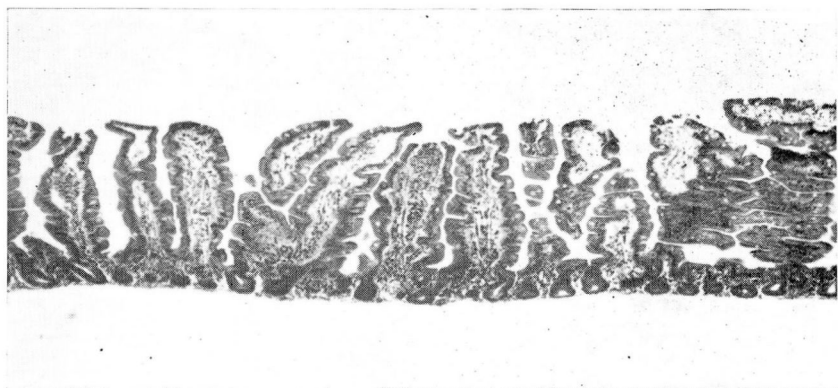
Fig. 3. Photomicrograph of small intestinal biopsy specimen demonstrating essentially normal mucosa. Hematoxylin-eosin-methylene blue stain; magnification \times 50 .

carotene levels and tests of pancreatic exocrine function were normal. Furthermore, among patients with diabetes mellitus, diarrhea or steatorrhea, or both conditions, seem to be related to the severity and the duration of the diabetes mellitus.