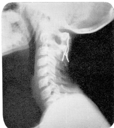
Fig. 3. Roentgenogram of lateral cervical spine showing solid spinal fusion extending from the first to the third cervical vertebrae with posterior bone graft and wire fixation.

spinous process space between the first and second cervical vertebrae was increased. The dura between the first and second cervical vertebrae was transparently thin.