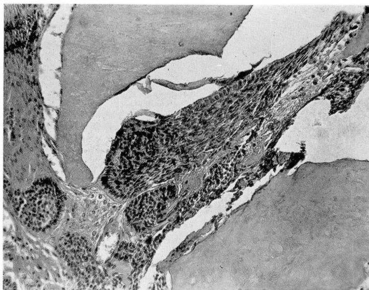
Fig. 3. Photomicrograph of an area of the odontoma in osseous tissue, showing islands of spindle cells with peripheral palisading. Hematoxylin and eosin stain; magnification \times 180 .

Postoperatively this patient has done well and now has no evidence of recurrence of the tumor. Her only postoperative difficulties have consisted of discomfort in the lower right first bicuspid and pain in the temporomandibular joint. This pain has recurred about once a month. In July of 1965, a maxillary night-bite guard was inserted in an effort to alleviate this sporadic pain. The face now is symmetric.