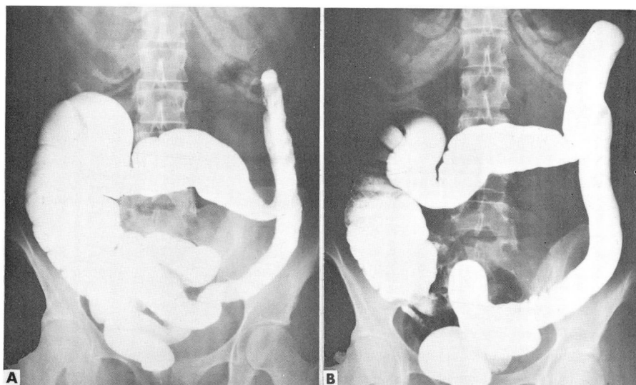
Fig. 1. A, Roentgenogram showing evidence of active ulcerative colitis. Note the finely serrated margin of the rectosigmoid through the splenic flexure. B, Two years later; there is no evidence of ulcerative activity.

Three of the acutely ill patients responded satisfactorily. They all improved within a month of the initiation of the alkylation therapy. One of these was a young woman with a rectovaginal fistula ( Fig. 1A ) that was no longer evident after three months. Two years later, findings on barium enema and proctosigmoidoscopic examinations were entirely normal ( Fig. 1B ).