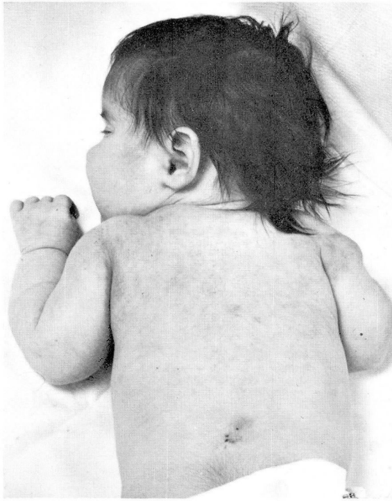
Fig. 1. Photograph taken on the second hospital day, demonstrating the elevated, firm, nodular, subcutaneous lesions on the back.

started. The serum calcium level decreased to 13.1 mg. per 100 ml. on the fourteenth hospital day, and to 11.2 mg. three days later. Only at that time did the urine specimen register a negative Sulkowich test; previously, repeated tests on urine specimens taken just before feeding were 3 or 4+. The mother's serum calcium content was 9.6 mg. per 100 ml., and serum phosphorus, 2.2 mg. per 100 ml.