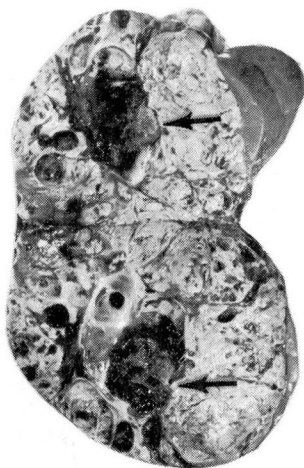
Fig. 3. Section of the neoplastic mass with an endothelial-lined cavity in the center (arrows) representing the arteriovenous fistula, and partly filled with tumor and organized blood clot.

typical of a renal tumor. The preoperative blood pressures showed a wide range of pulse pressures, from 94 to 115 mm. of Hg with variable diastolic pressures from normal to slightly elevated.