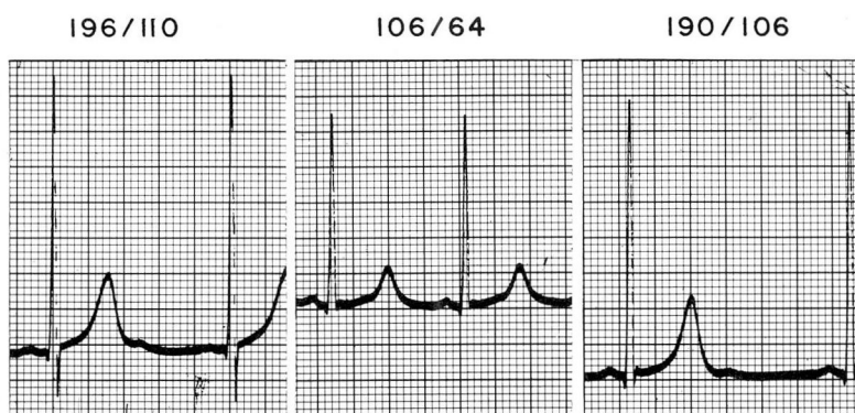
Fig. 1. Electrocardiograms ( V_5 ) showing decreases in voltage of the R wave during normotensive period (after administration of sodium nitroprusside), and increases in voltage after hypertension returns, following termination of sodium nitroprusside administration.

Changes in the voltages of S waves in V_1 or V_2 were not consistent. In one half of the patients an increase occurred, ranging from 1 to 6 mm., the mean increase being 11 per cent of the control values. In the other half the voltages were reduced from 1 to 8 mm., the mean reduction being 13.9 per cent of the control values. The sums of R waves in V_5 and S waves in V_1 were reduced in