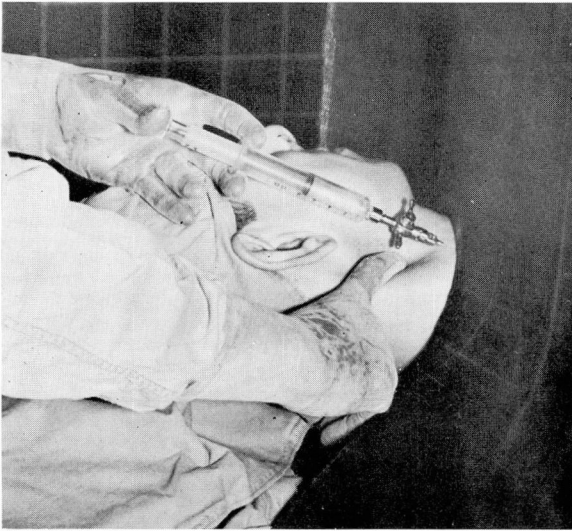
Fig. 2. Photograph showing retrograde injection of the right carotid artery.

In the anesthetized patient, a No. 18 gauge needle is inserted percutaneously in the common carotid artery. Any technic for carotid artery puncture may be used for retrograde studies, but the needle should be inserted into the carotid artery pointing downward ( Fig. 2 ).