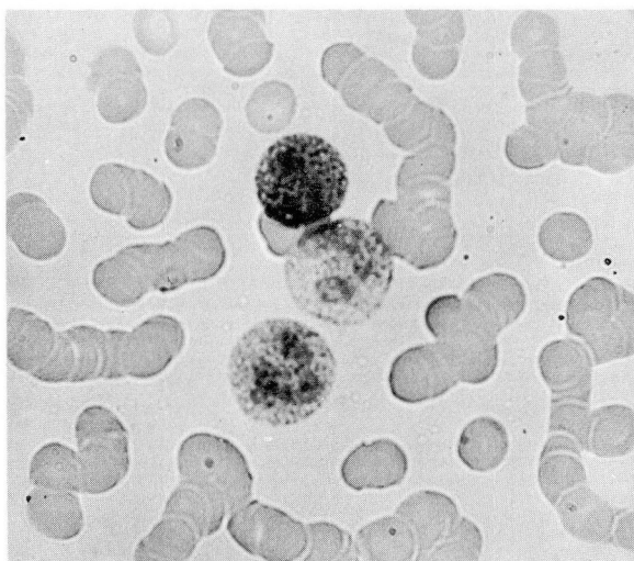
Fig. 1. A photomicrograph of three segmented neutrophils showing alkaline phosphatase activity represented by a (red-brown) precipitate of varying density in the cytoplasm. The upper neutrophil is graded 4+, the central neutrophil, 2+, and the lower neutrophil, 3+. Magnification \times 1000 .

When alkaline phosphatase is present in a cell ( Fig. 1 ) it is represented by a red-brown precipitate in the cytoplasm. The amount of this precipitate varies