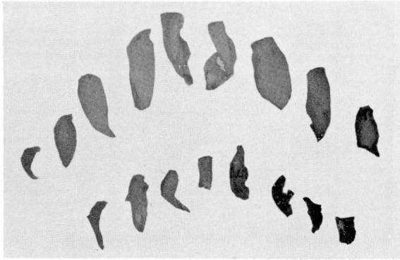
Fig. 2. Conization specimens reduced to serial blocks. (From Krieger, J. S., and McCormack, L. J.: Surg. Gynec. & Obst. 109: 328-332, Sept. 1959; by permission of SURGERY, GYNECOLOGY & OBSTETRICS.)

needless laceration of the cervix and to obtain as large a specimen as is practicable. Efforts should be made to extend the conization as close to the internal os as possible. A Heyman loop is used for cautery conization immediately after the sharp-knife procedure. It is believed that this improves the appearance of the healed cervix and is of value in controlling bleeding. Final hemostasis is obtained with a ball-point cautery.