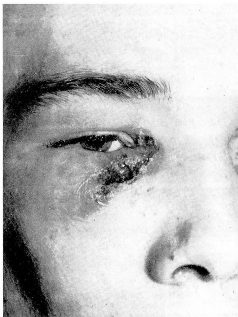
FIG. 2. Showing chronic ulceration of inner canthus and lower eyelid; ulcer of 6 weeks' duration.