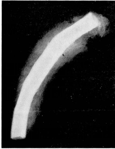
FIG. 4. X-ray of removed specimen showing rubber tube in center.

tube slightly to the right side of the spine and well below the liver shadow. The patient was discharged on the fifteenth postoperative day after a satisfactory convalescence.