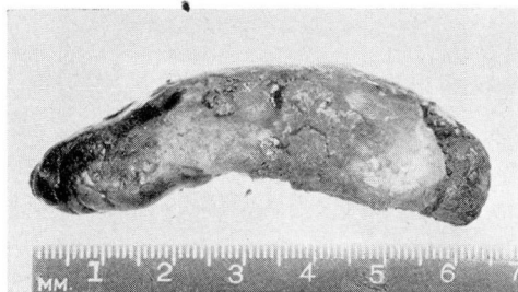
FIG. 2. Longitudinal view of calculus-encrusted rubber tube.

period. The patient thought he had detected blood in the urine on several recent occasions.