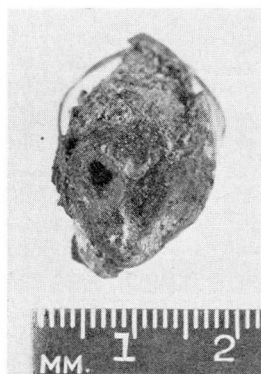
FIG. 3. View of cross-section of calculus showing lumen of rubber partially preserved at this point. (The ends were occluded.)

The patient, then aged 32 years, entered the hospital on September 12, 1924, complaining of abdominal pain which had persisted for 3 days. Physical examination was negative except for the presence of tenderness and rigidity in the right upper quadrant of the abdomen. The urine was normal. A diagnosis of acute cholecystitis was made and operation performed a few hours after admission. The abdomen was opened through a vertical incision and the gallbladder wall found to be thickened, dark red in color with purple and gray patches. A stone could be felt in the region of the cystic duct. What was taken to be the cystic duct was divided, but it was recognized immediately that the common duct had been divided instead. The true cystic duct and cystic vessels were then identified and divided, and the gallbladder removed. The divided common duct was repaired over a rubber tube with interrupted sutures of fine catgut. The common hepatic duct was drained. The abdomen was drained and the wall closed. The pathologist reported active, chronic purulent cholecystitis with cholelithiasis. An x-ray of the abdomen taken on the fourteenth postoperative day showed the rubber