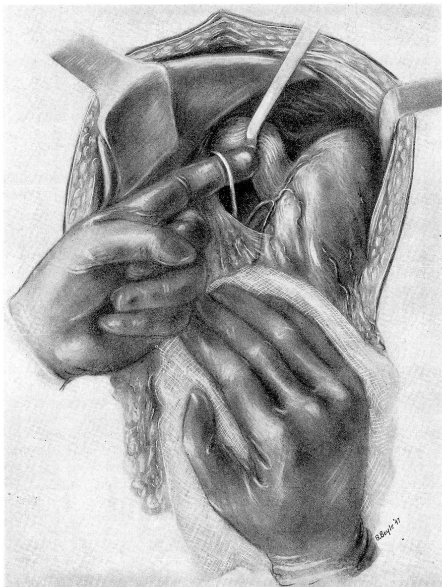
FIG. 2. Posterior vagus hooked over finger and brought forward from its position posterior to esophagus.