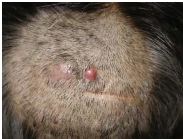
Figure 1. Two smooth, pink, rubbery nodules in the occipital region. The nodules had grown in size over the past 3 months.