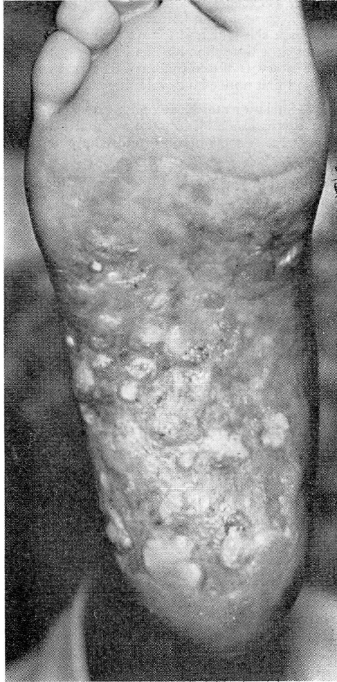
FIGURE 3. Radiodermatitis of sole following roentgen therapy for epidermophytosis. Case 5.

therapy when the dermatophytosis is obstinate or hyperkeratotic. Roentgen rays do not kill fungi, but are used for their stimulating and healing effect on tissues. Consequently, seldom more than 6-10 treatments of 75 r each at weekly intervals is necessary.