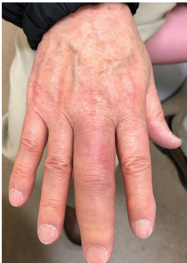
Figure 1. At presentation, the patient's right middle finger was swollen, with a sausage-like appearance.

Histology revealed exudative synovitis with lym-