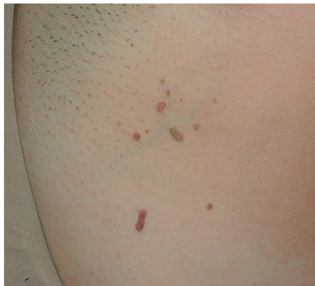
Figure 2. Acrochordons on the axillae.

Computed tomography showed no evidence of lung cysts or kidney tumor. Regular cancer surveillance was instituted.