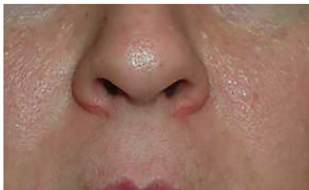
Figure 1. Multiple whitish to skin-colored papules on both cheeks.

A 43-YEAR-OLD WOMAN PRESENTED to the dermatology department with multiple small skin-colored papules on her cheeks ( Figure 1 ) and acrochordons (“skin tags”) on the axillae ( Figure 2 ). She reported that they had appeared over the past few years. Her personal medical history was unremarkable, but she had a first-degree relative with renal carcinoma.