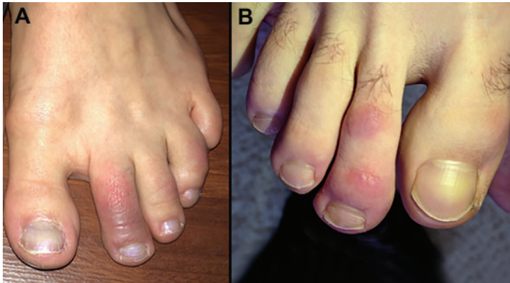
Figure 4. Pseudo-chilblains (“COVID toes”). (A) A 24-year-old woman developed painful erythematous and violaceous macules involving her dorsal toes after testing positive for COVID-19. She had no other symptoms. (B) A young adult man sought care in a telemedicine encounter after developing painful, erythematous papules on his toes. His eventual COVID-19 status is unknown.

Information is accumulating about pernio-like lesions in ‘long-hauler’ COVID-19 patients