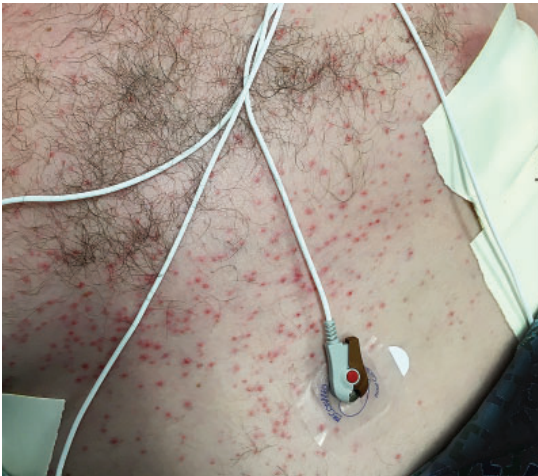
Figure 3. Vesicular eruption in COVID-19. A 52-year-old man developed a vesiculo-pustular eruption on his trunk during hospitalization for COVID-19 requiring intensive care unit admission and mechanical ventilation for acute respiratory failure due to respiratory distress syndrome. He recovered and was eventually discharged.

guide early testing (Figure 2). 13 Additionally, an analysis of 200 patients with COVID-19 with cutaneous manifestations 14 found a significant association between urticaria and gastrointestinal symptoms, which could assist clinicians in their anticipatory management.