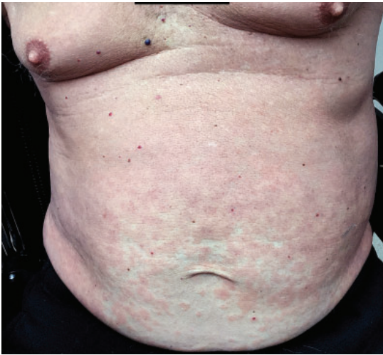
Figure 1. Morbilliform rash in COVID-19. A 77-year-old man was hospitalized with COVID-19 and developed bilateral pneumonia and acute hypoxic respiratory failure. Four days after discharge, while continuing to have low-grade fevers, he developed pink papules confluent over the trunk and extremities consistent with a morbilliform eruption.