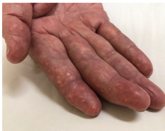
Figure 1. Multiple nontender papules were noted on all fingers.

Radiography of the elbows revealed erosions of the distal humerus and increased nodular soft-tissue density. Aspiration of the nodule on the left elbow revealed needle-shaped