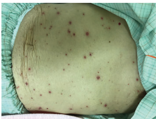
Figure 1. Hemorrhagic vesicles with red haloes of various sizes distributed over the whole body.