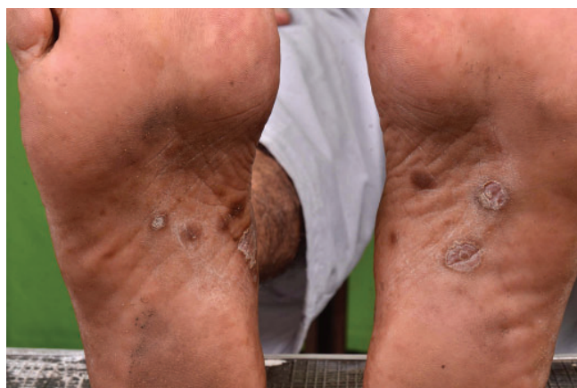
Figure 2. Well-defined dusky, discoid plaques with peripheral desquamative scaling on the instep of the patient's soles. Some of the lesions appear psoriasiform.

A 51-YEAR-OLD MAN presented with a 3-month history of reddish-brown lesions on his body and scaly brown lesions on the palms and soles and a 1-month history of mildly painful oral erosions. He had also noticed a buzzing sound in the right ear for the past 20 days.