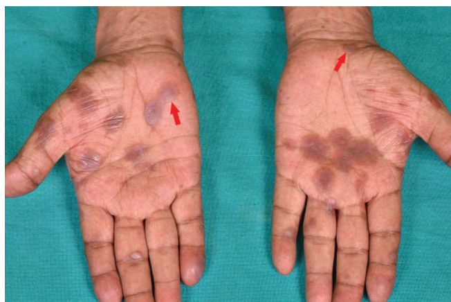
Figure 1. Well-defined dusky, discoid patches and plaques with peripheral collarette of scales (red arrows) on the palms.