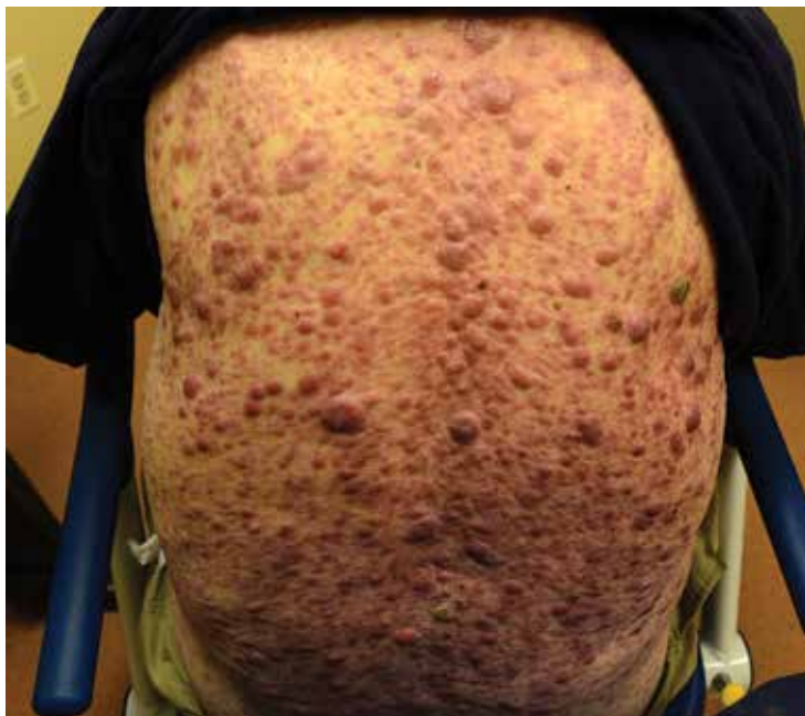
Figure 1. The firm, indurated nodules ranged in size from 1 to 4 cm.

Immunohistochemistry study demonstrated that the cells co-expressed T-cell markers (CD4 and CD43) and monocyte markers (CD68 and lysozyme). CD30 and ALK-1 were not expressed, ruling out primary cutaneous CD30 T-cell lymphoproliferative disorders