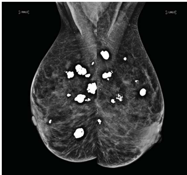
FIGURE 2. Mammography confirmed the presence of lesions in both breasts.

pathological study. Br J Radiol 1976; 49:12–26.