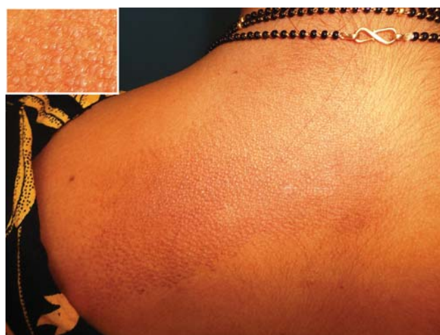
FIGURE 1. As seen in the inset, the skin-colored to hyperpigmented plane-topped papules coalesced to form a plaque over the left scapular area.

Our patient's scapular lesions and first-degree family history of MEN type 2A confirmed the diagnosis of the newly recognized variant, MEN type 2A-related cuta-