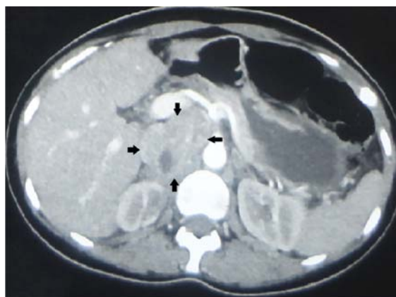
FIGURE 3. Computed tomography of the abdomen with contrast showed a heterogeneously enhancing lesion (arrows) in the right suprarenal area that measured 6.5 \times 5.5 \times 3.5 cm and displaced the inferior vena cava anteriorly.

genetic background, cutaneous lichen amyloidosis is also associated with familial medullary thyroid carcinoma, another rare variant of MEN type 2A. 4