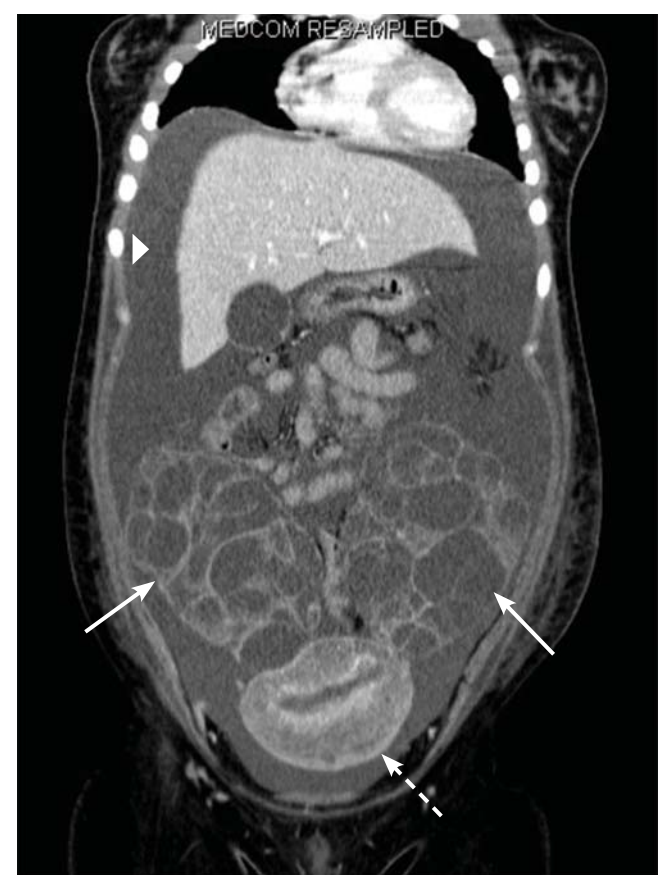
FIGURE 2. Coronal view of computed tomography of the abdomen and pelvis with contrast enhancement showed significant ascites (arrowhead) and enlargement of both ovaries with multiple cysts (arrows). The uterus (dashed arrow) also appears heterogeneous and edematous with fluid in the endometrium.

Mild OHSS can be treated on an outpatient basis with bed rest, oral analgesics, limited oral intake, and avoidance of vaginal intercourse, and usually resolves in 10 to 14